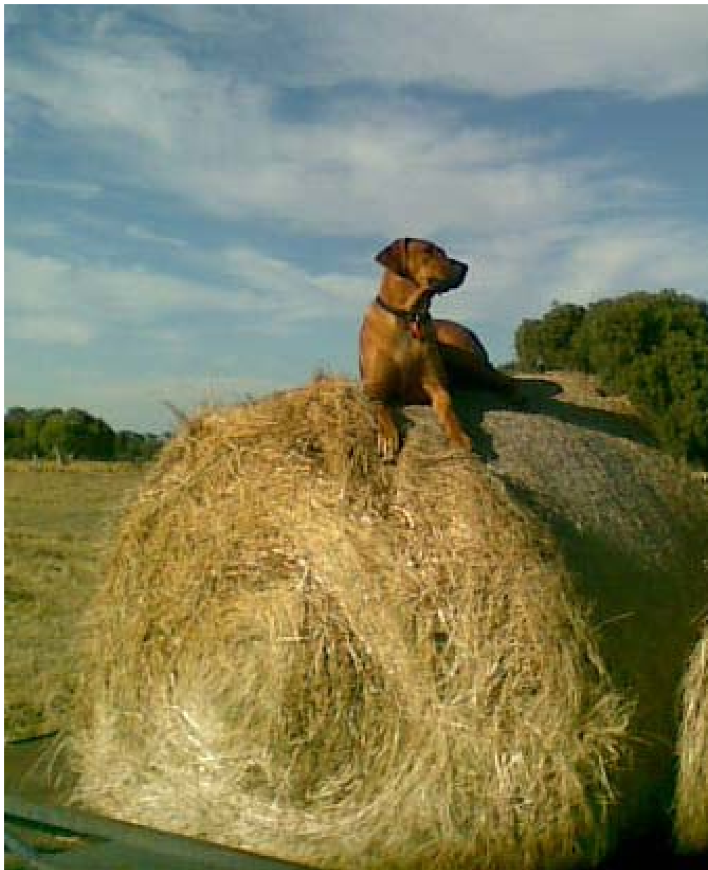
On top of the World

THE RHODESIAN RIDGEBACK CLUB OF WESTERN AUSTRALIA (Inc)